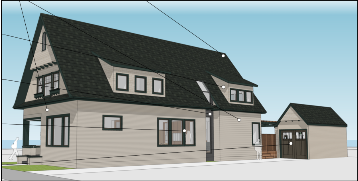
Proposed South Elevation and New Garage