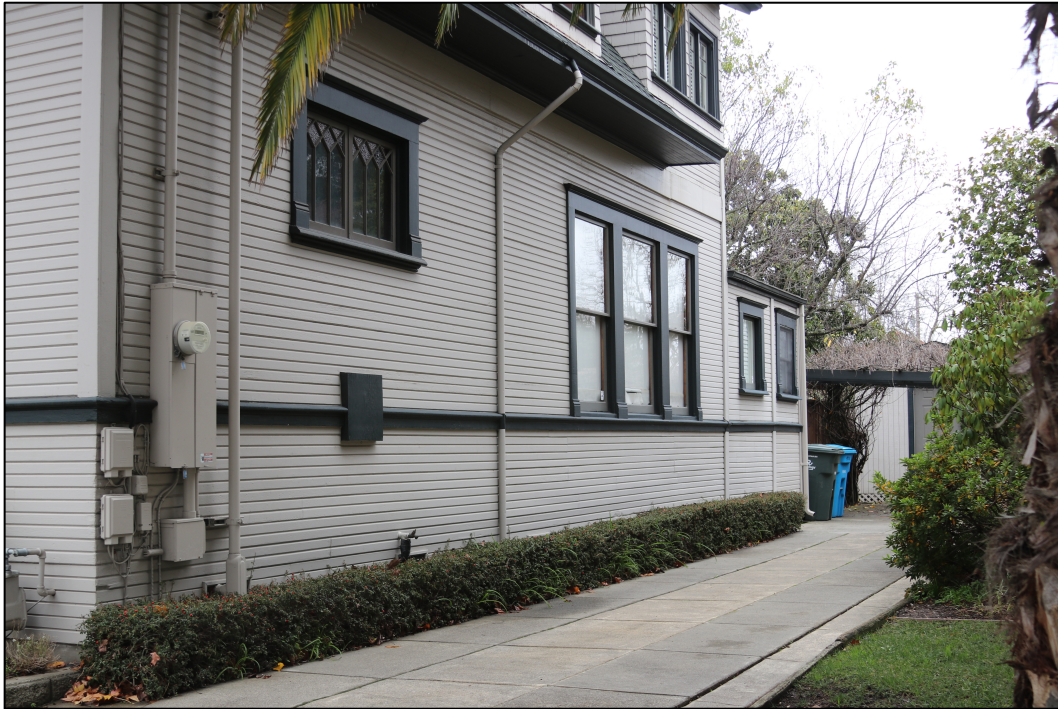
Existing South Elevation, looking east