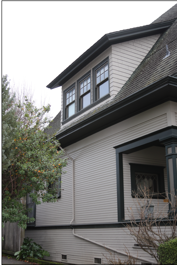
Existing dormer on North elevation; proposed new wing at rear would have matching dormers on the north and south elevations