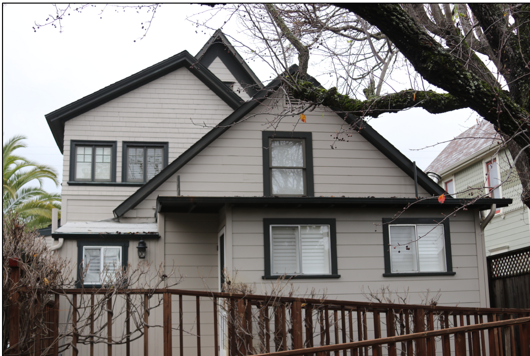
Existing East Elevation, non-historic wings to be replaced