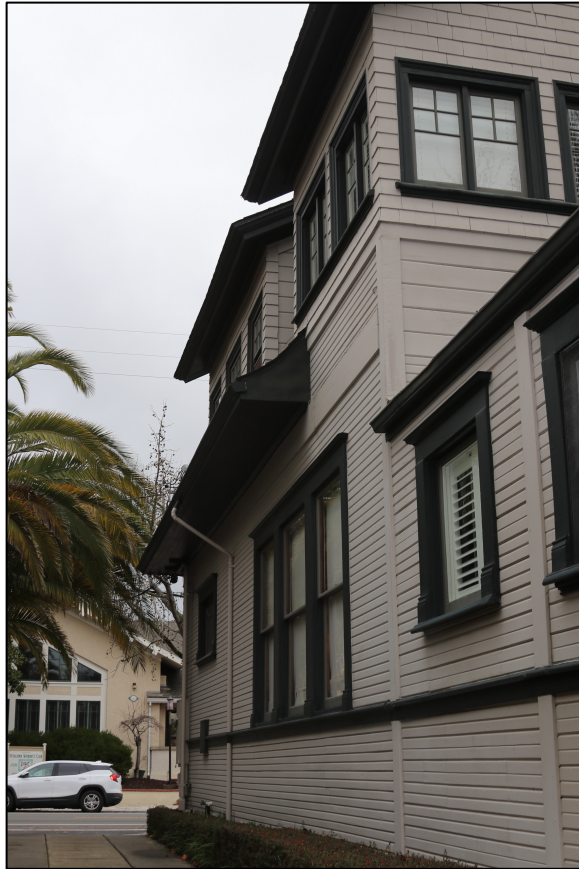
Existing South Elevation, window on far right is 1998 infill to be replaced with lightwell